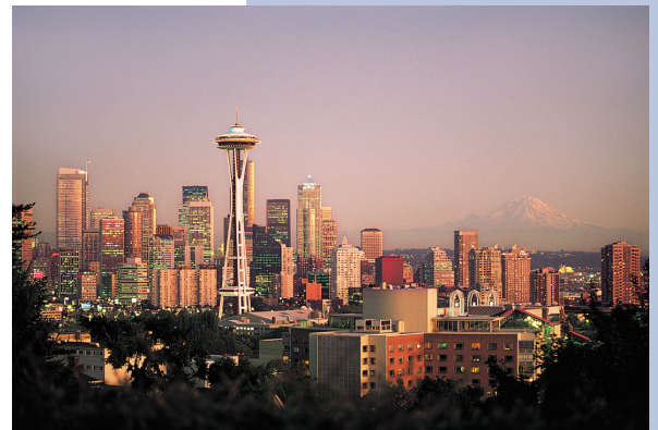
Science and Strategies for Safe Environments.

If using a bus that runs through the Metro Bus Tunnel, get off at Westlake Center station, exit onto 4th Avenue. Walk one block North to Stewart St. and then 2 blocks East to the Plaza 600 Building.